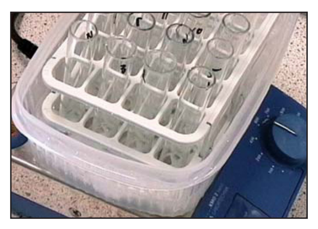
Figure 1. Arrangement of ice-water bath over a magnetic stirrer for treatment of samples with 2 M KOH and dissolution of RS.